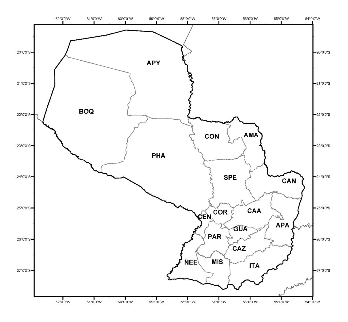
Figure 1. Map of Paraguay showing the political departments: Chaco region – Alto Paraguay (APY), Boquerón (BOQ), Presidente Hayes (PHA); Oriental region – Amambay (AMA), Alto Paraná (APA), Caaguazú (CAA), Canindeyú (CAN), Caazapá (CAZ), Central (CEN), Concepción (CON), Cordillera (COR), Guairá (GUA), Itapúa (ITA), Misiones (MIS), Ñeembucú (ÑEE), Paraguarí (PAR), San Pedro (SPE).

eco–regions in Paraguay—Chaco, Cerrado, Mesopotamian Grasslands, and Pantanal. Thus, it suggests that Bertoni's familiarity of the fauna is biased towards a specific geographical area and habitat that covers only a small percentage of Paraguayan territory. This premise is supported by the absence of prevalent and common elements of the Pantanal, Chaco, and Cerrado faunae from his lists and the vagueness of the distribution data for those taxa that are included.