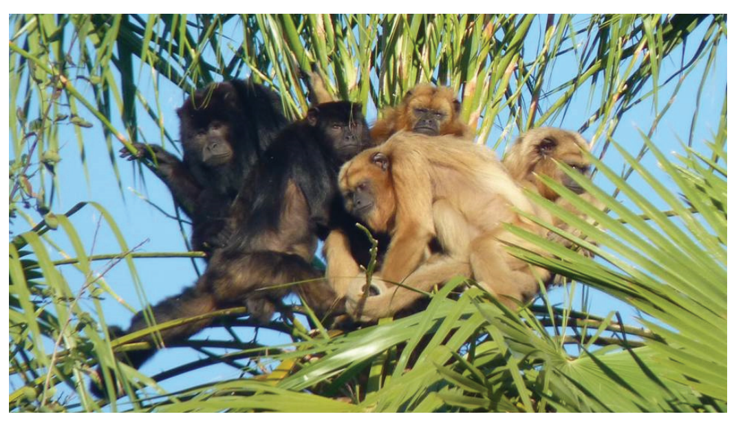
Figure 11. Black-and-gold Howler Monkey Alouatta caraya , Estación Tres Gigantes, Alto Paraguay department. (Photo: Paul Smith).

Only the hooded capuchin Sapajus cay (Illiger, 1815) occurs in Paraguay, a member of the cryptic " Cebus apella " complex. The correct scientific name for Paraguayan Sapajus has been the subject of constant debate (Elliot, 1913; Cabrera, 1917, 1939, 1957; Hill, 1960; Torres, 1983; Mantecon et al. , 1984; Brown & Rumiz, 1985; Mudry, 1990; Zunino & Mudry, 1993; Ponsà et al. , 1995; Groves, 2001; Silva Junior, 2001; Martínez et al. , 2002, 2004; Ávila, 2004; Casado et al. , 2010; Rylands et al. , 2012; Aristide et al. , 2014), and descriptions of several species and subspecies have been based on specimens from Paraguay (Rengger, 1830; Pusch, 1941).