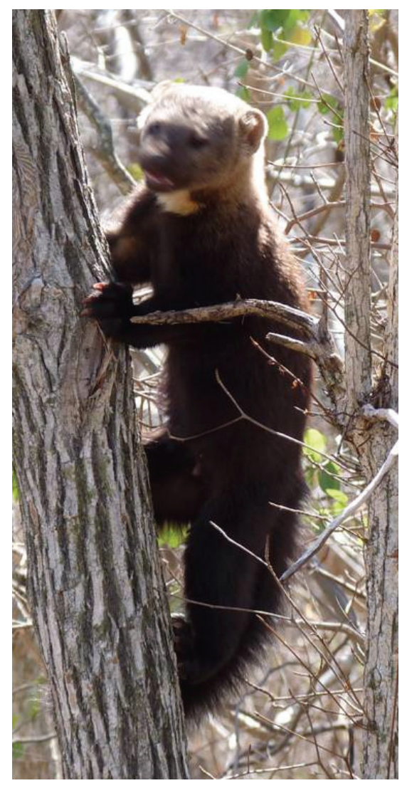
Figure 10. Tayra Eira barbara, Cerro León, Alto Paraguay department.

specimens were attributed to the "form mapurito " (spelled incorrectly and differently in each publication), and the name can be assumed to have been applied to the same specimens.