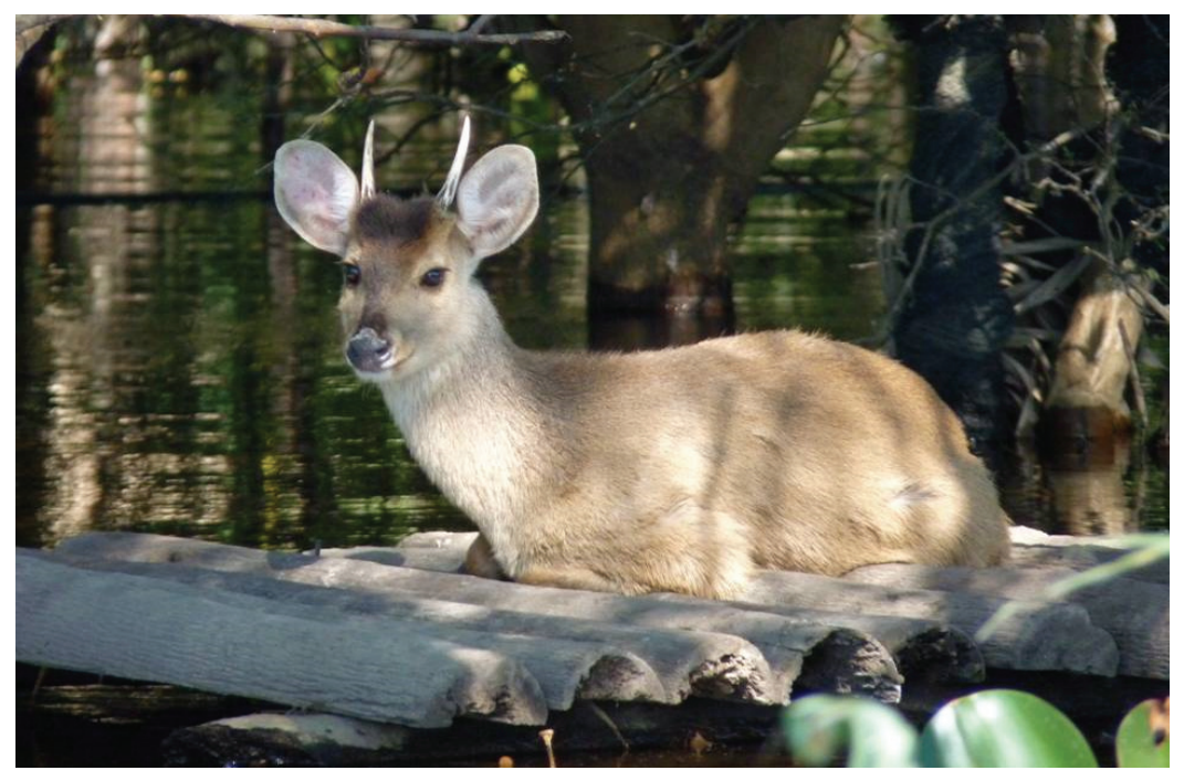
Figure 7. Brown Brocket Subulo gouazoubira, Río Negro, Alto Paraguay department.

ID = BROWN BROCKET Subulo gouazoubira (G. Fischer, 1814) (Figure 7) Cervus gouazoupira G. Fischer, 1814: 465 Cervus simplicicornis Illiger, 1815: 108 Cervus nemorivagus F. Cuvier, 1817: 485 Mazama Rafinesque, 1817: 363 Coassus J.E. Gray, 1825: 342 Subulo C.H. Smith, 1827: 318 Mazama gouazoubira: Hershkovitz, 1951: 567 Coassus nemorivagus (1914a)