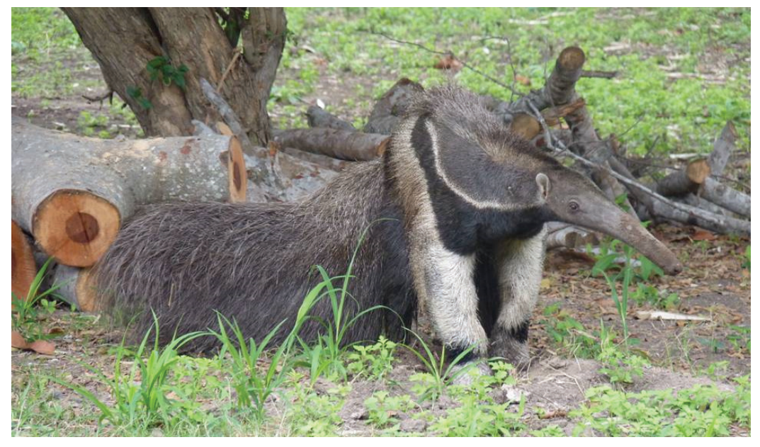
Figure 4. Giant Anteater Myrmecophaga tridactyla , Estación Tres Gigantes, Alto Paraguay department.

ID = GIANT ANTEATER Myrmecophaga tridactyla Linnaeus, 1758 (Figure 4) Myrmecophaga Linnaeus, 1758: 35 [Myrmecophaga] tridactyla Linnaeus, 1758: 35 [Myrmecophaga] jubata Linnaeus, 1766: 52 Myrmecophaga (1904b; 1915) Myrmecophaga jubata (1914a)