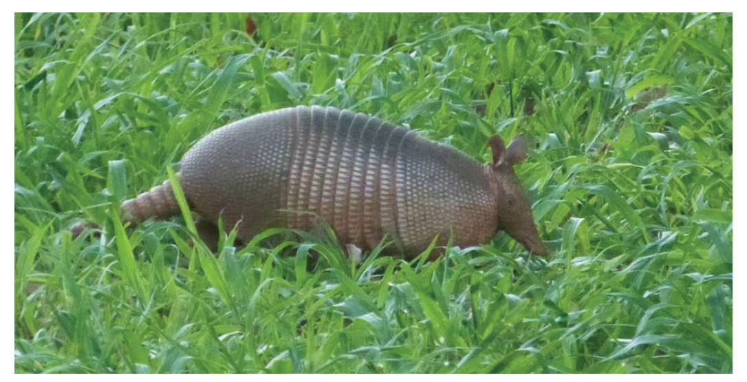
Figure 5. Nine-banded Armadillo Dasypus novemcinctus , Refugio Biológico Itabó, Alto Paraná department..

Dasypus Linnaeus, 1758: 50 [Dasypus] novemcinctus Linnaeus, 1758: 51 Tatusia Lesson, 1827: 309 Tatusia novemcincta (1914a)