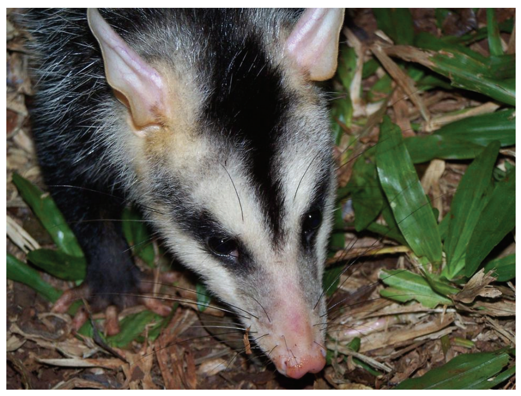
Figure 2. White-eared Opossum Didelphis albiventris , Estancia Nueva Gambach, Itapúa department.