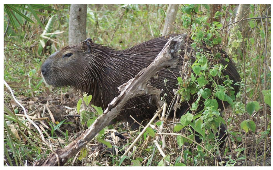
Figure 8. Capybara Hydrochoerus hydrochaeris, Río Negro, Alto Paraguay department..