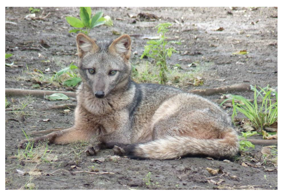
Figure 9. Crab-eating Fox Cerdocyon thous , Estación Tres Gigantes, Alto Paraguay department.

Comments: This is, in part, the Agüarachay of Azara (1802, 1: 271; see Smith & Ríos, in press) and l'Agouarachay of Azara (1801, 1: 317). Bertoni (1914a) listed only Canis brasiliensis Schinz, 1821, for Paraguay (a name based partly on Azara), with Canis thous treated as hypothetical, but he later confessed his ongoing confusion as to the nomenclature (Bertoni, 1925b).