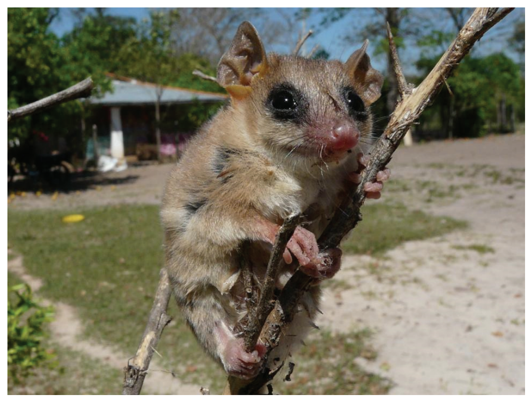
Figure 3. Chaco Mouse Opossum Cryptonanus chacoensis , Rancho Laguna Blanca, San Pedro department.

(NHM 4.1.5.48; 11 September 1903). It appears that Bertoni's concept of M. pusilla included both of these species.