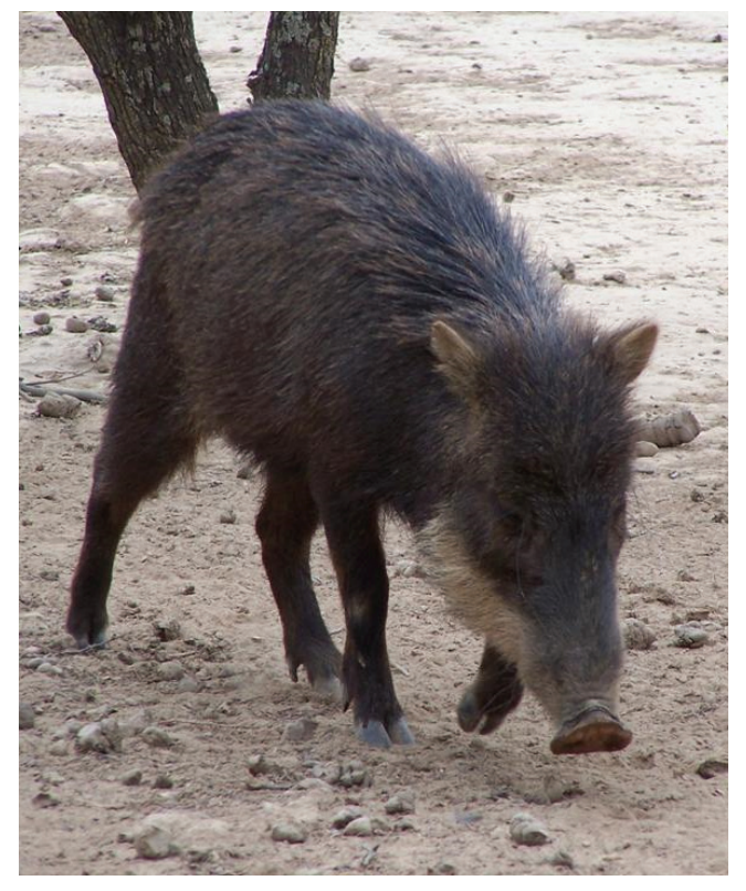
Figure 6. White-lipped Peccary Tayassu pecari , Fortín Toledo, Boquerón department. (Photo: Paul Smith).

ID = WHITE–LIPPED PECCARY Tayassu pecari (Link, 1795) (Figure 6) Tayassu G. Fischer, 1814: 284 S[us]. Pecari Link, 1795: 104 Sus albirostris Illiger, 1815: 108 Tayassu albirostris (1914a)