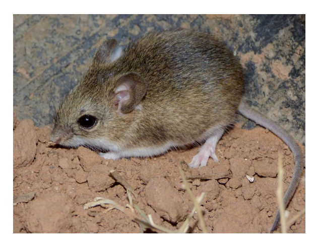
Figure 1. Adult Andalgalomys pearsoni showing main external characteristics. Teniente Enciso National Park, Boquerón department, 2 July 2022 (Paul Smith).

Pearson's Chaco Mouse Andalgalomys pearsoni (Myers, 1977) is a nocturnal and terrestrial, Chaco endemic Sigmodontine rodent, confined to the lowland Dry Chaco ecoregion of western Paraguay and southwestern Bolivia (Braun 2015) with an old specimen record from Salta province, Argentina (Teta et al. 2016). It is a distinctive mouse, instantly recognizable within its area of distribution by the sandy-yellow dorsum sharply demarcated from the white ventral pelage, a tail longer than the head and body length which lacks a tuft at the tip and the distinct whitish spots behind the ears (Fig. 1) (Salazar-Bravo 2015, Teta et al. 2016). The genus Andalgalomys Williams & Mares, 1978 contains three species (A. olrogi, A. pearsoni and A. roigi)