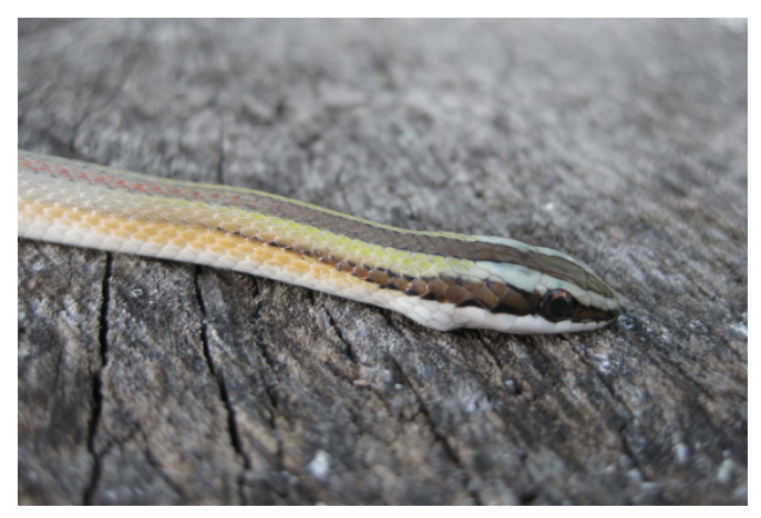
FIGURE 3. Detail of the head of L. paucidens (CZPLT-H-122).

Paraguay 2008) due to the extraordinarily high number of globally (11) and nationally (47) threatened bird species occurring within the reserve. Indications from ongoing herpetological inventories suggest that it is also an area of national and international importance for the conservation of reptiles and amphibians, given that despite its small size it boasts the highest amphibian and reptile species lists of any protected area in Paraguay (Smith et al. 2012, Para La Tierra unpublished data). Consolidating the long term conservation of the RNLB should be a national conservation priority.