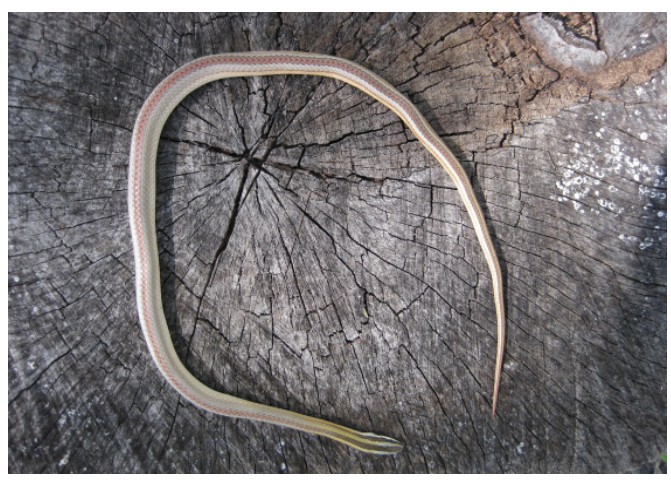
FIGURE 2. Specimen of Lygophis paucidens (CZPLT-H-122) found at Reserva Natural Laguna Blanca, in San Pedro Department, Paraguay.

Though small, the importance of the RNLB for conservation in Paraguay should not be underestimated. With over 400 hectares of globally threatened, pristine Cerrado habitat, plus an artesian lake arising from the Guarani Aquifer, the reserve is of both national and international importance. It was declared an Important Bird Area by Birdlife International (IBA PY021- Guyra