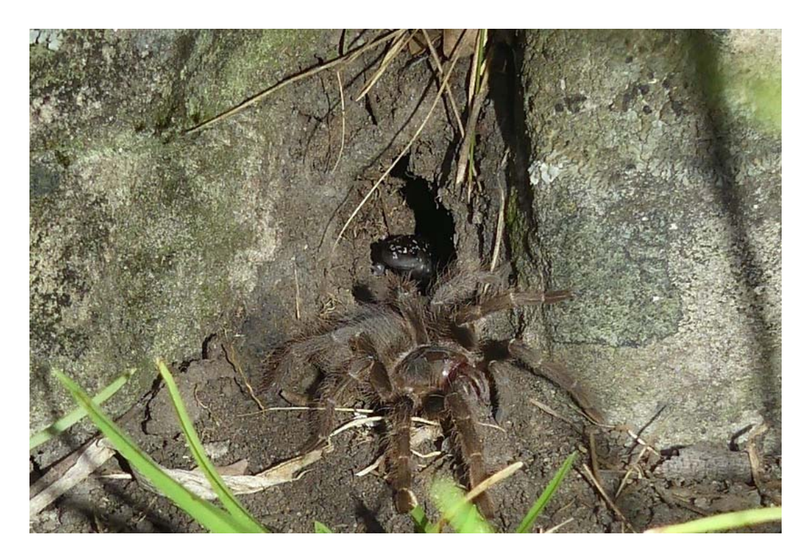
Figure 1. Eupalaestrus campestratus emerging from a burrow that contains Chiasmocleis albopunctata at Balneario Pinamar, Paraguarí department, Paraguay.