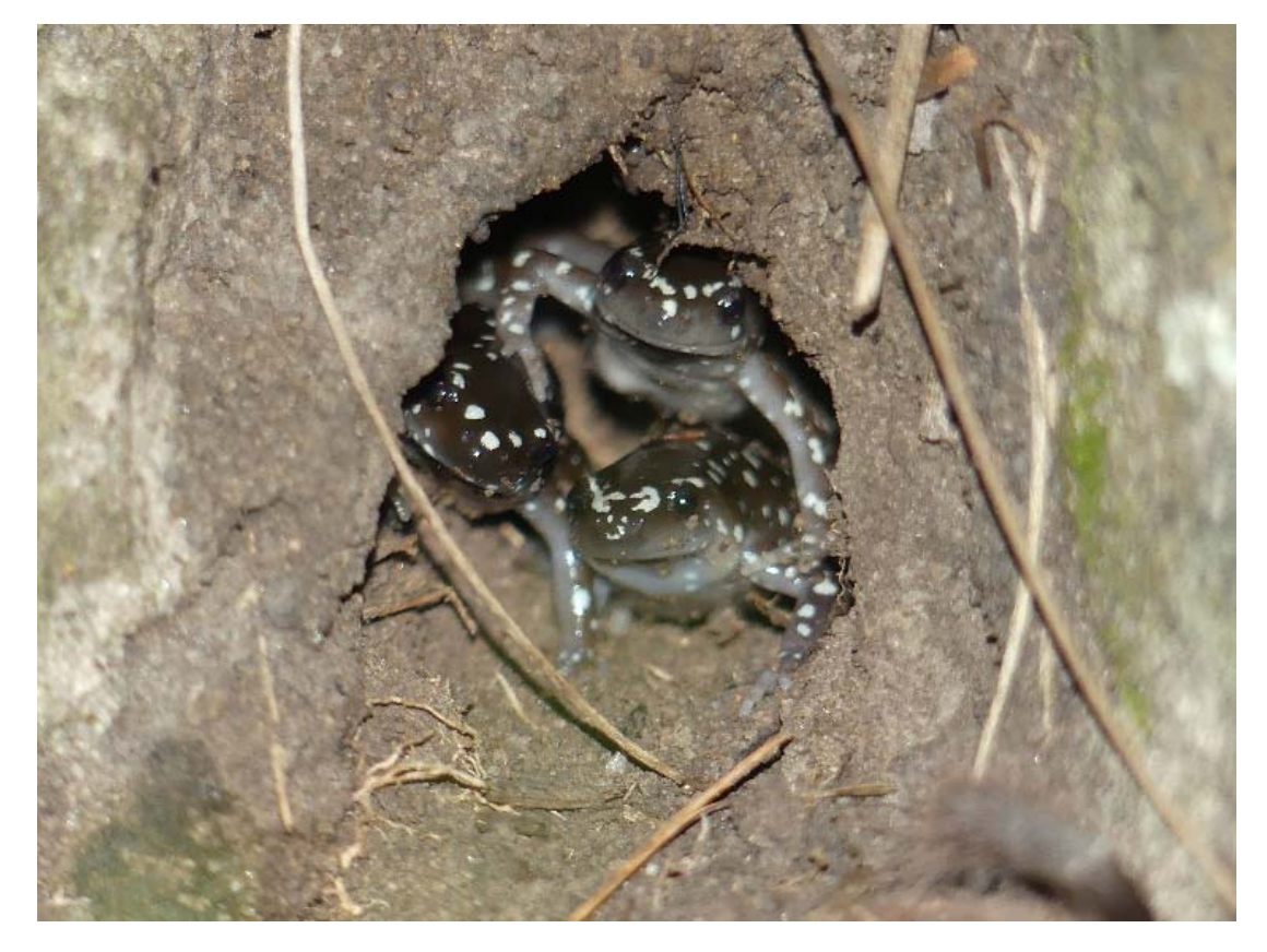
Figure 2. Three Chiasmocleis albopunctata visible inside a burrow from which a spider has recently emerged.