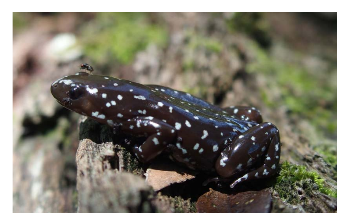
Figure 3. Chiasmocleis albopunctata at Granja Francisca, Guairá department, Paraguay.