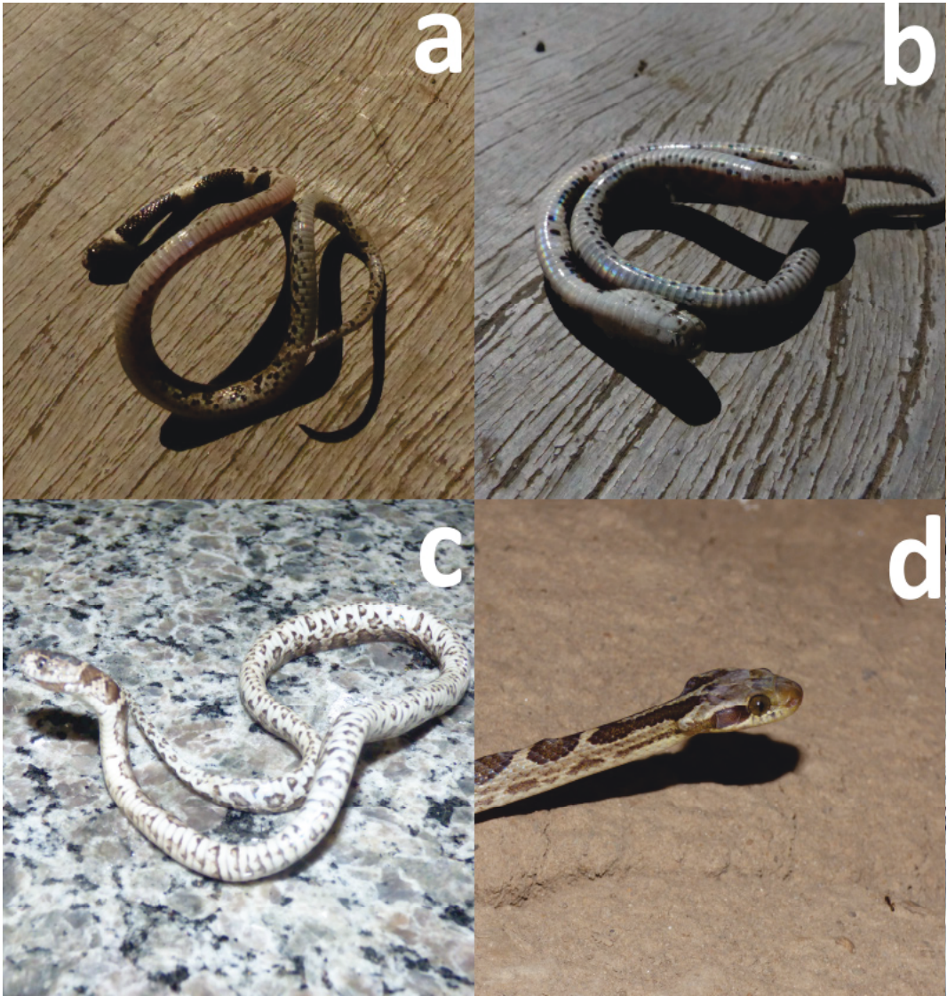
Figure 2. Defensive behaviour, a-b) death-feigning or thanatosis in Dipsas turgida , c) death-feigning or thanatosis in D. ventrimaculatus , d) triangulation of the head by Leptodeira annulata .

deter a predation attempt (Jara & Pincheira-Donoso 2015). Araújo & Martins (2006) link hooding behaviour in Bothrops to possible predation pressure from birds of prey, adding that it may help decrease the visibility of snakes in open situations when viewed from the air. Hooding has been reported in several South American genera that also occur in Paraguay including Bothrops , Dipsas , Erythrolamprus , Xenodon and Hydrodynastes (Greene 1975; Cadle & Myers 2003; Araújo & Martins 2006; Kahn 2011; Menezes et al. 2015). The authors