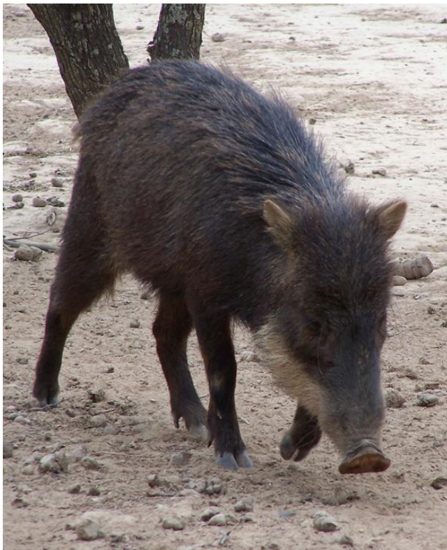
Figure 6. White-lipped Peccary Tayassu pecari , Fortín Toledo, Boquerón department. (Photo: Paul Smith).

Comments: This is the Tañicati of Azara (1802, 1: 19) and le Tagnicati of Azara (1801, 1: 25). The Guaraní name means stinking mandible in reference to the white lip and the strong smell of the species associated with secretions from the rump gland.