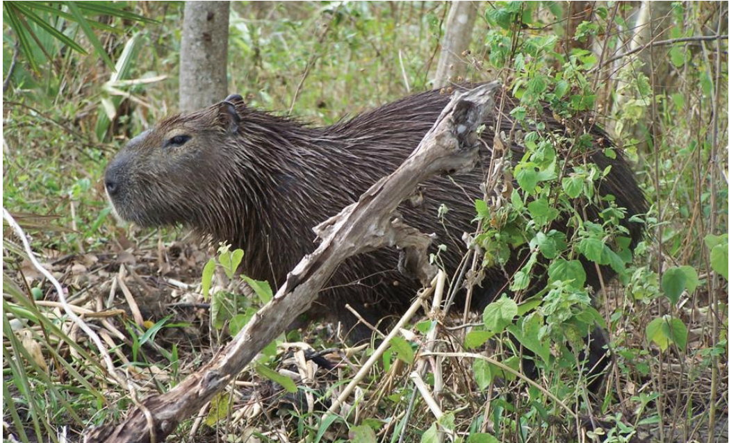
Figure 8. Capybara Hydrochoerus hydrochaeris , Río Negro, Alto Paraguay department. (Photo: Paul Smith).