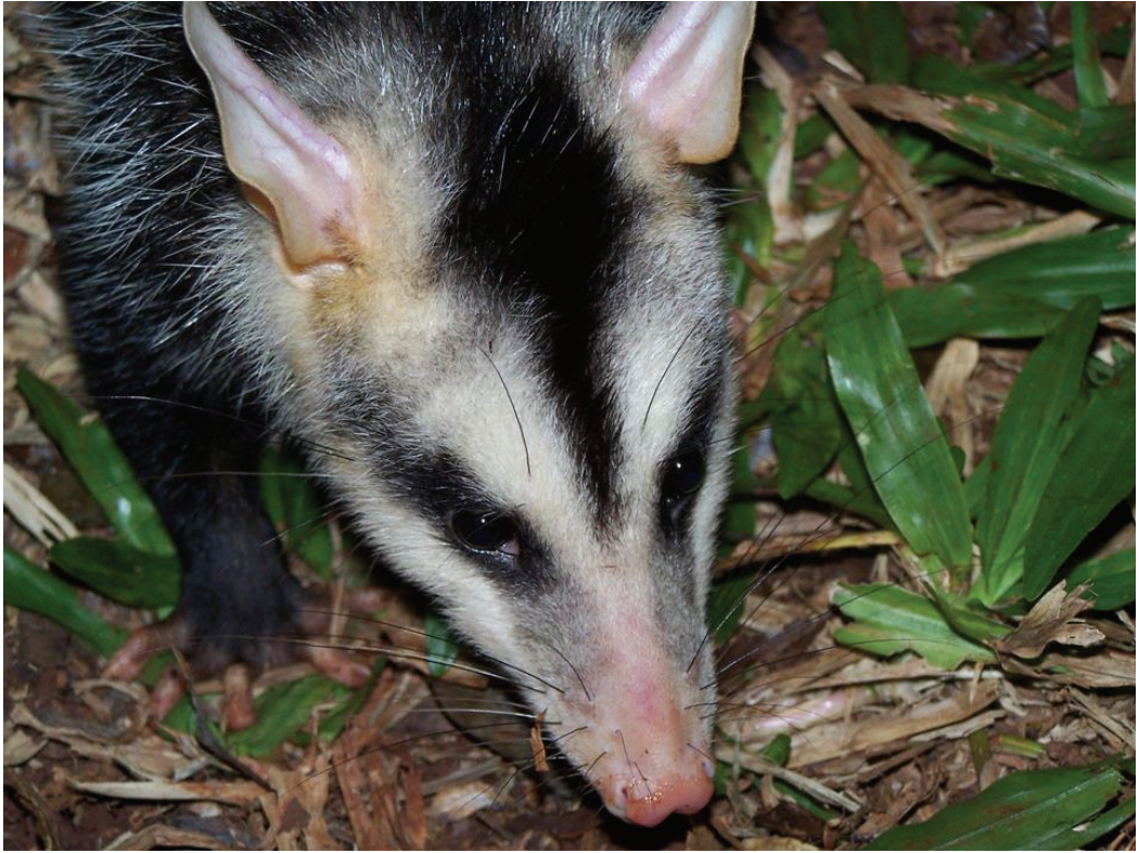
Figure 2. White-eared Opossum Didelphis albiventris , Estancia Nueva Gambach, Itapúa department.

“3 Didelphis marsupialis cancrivora (Gm.)”.