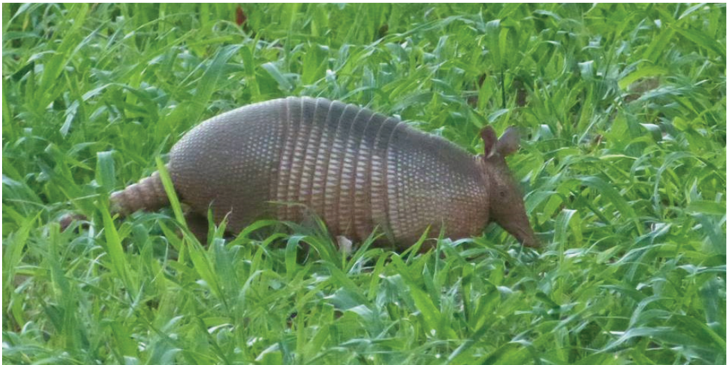
Figure 5. Nine-banded Armadillo Dasypus novemcinctus , Refugio Biológico Itabó, Alto Paraná department.