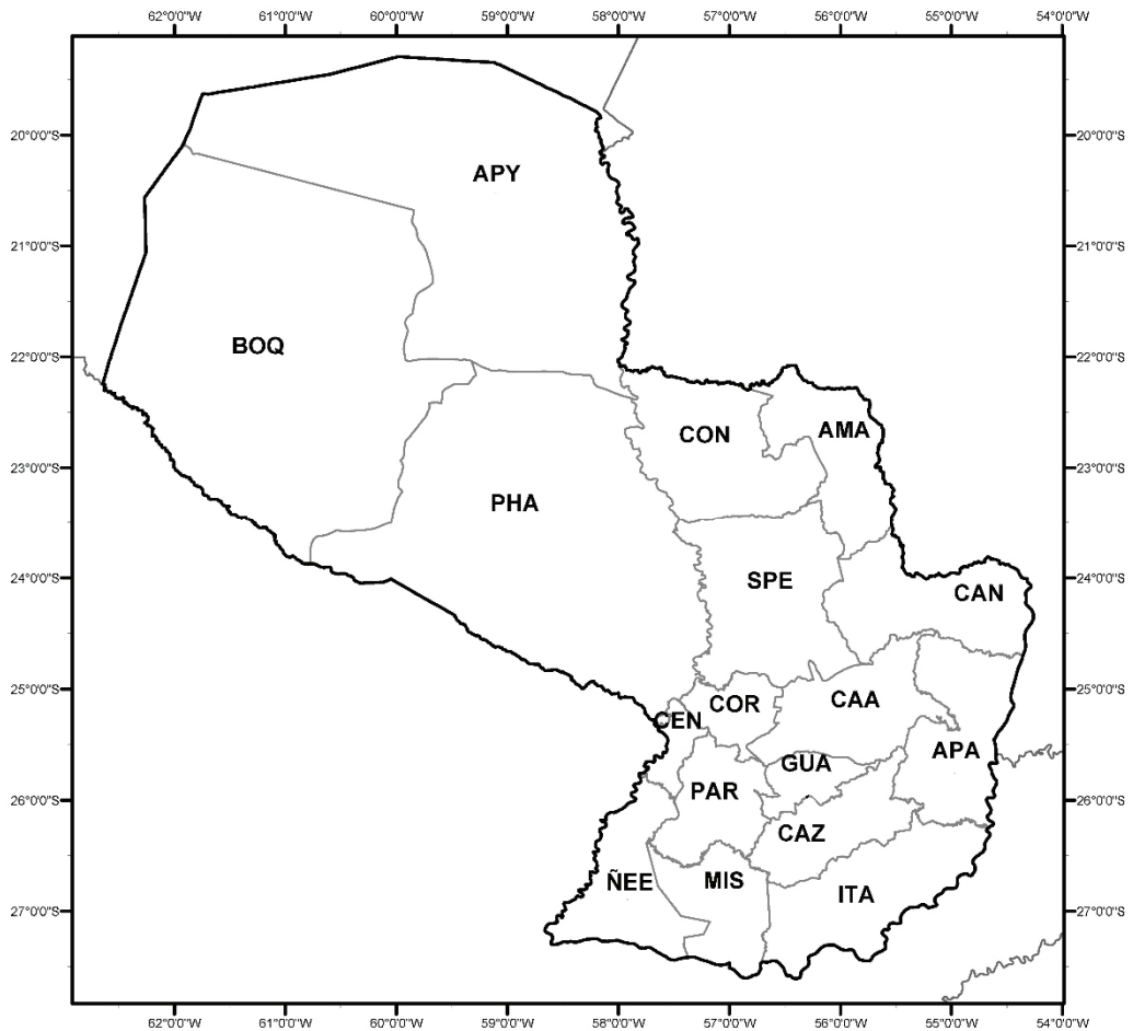
Figure 1. Map of Paraguay showing the political departments: Chaco region – Alto Paraguay (APY), Boquerón (BOQ), Presidente Hayes (PHA); Oriental region – Amambay (AMA), Alto Paraná (APA), Caaguazú (CAA), Canindeyú (CAN), Caazapá (CAZ), Central (CEN), Concepción (CON), Cordillera (COR), Guairá (GUA), Itapúa (ITA), Misiones (MIS), Ñeembucú (ÑEE), Paraguari (PAR), San Pedro (SPE).

eco–regions in Paraguay – Chaco, Cerrado, Mesopotamian Grasslands, and Pantanal. Thus, it suggests that Bertoni’s familiarity of the fauna is biased towards a specific geographical area and habitat that covers only a small percentage of Paraguayan territory. This premise is supported by the absence of prevalent and common elements of the Pantanal, Chaco, and Cerrado faunae from his lists and the vagueness of the distribution data for those taxa that are included.