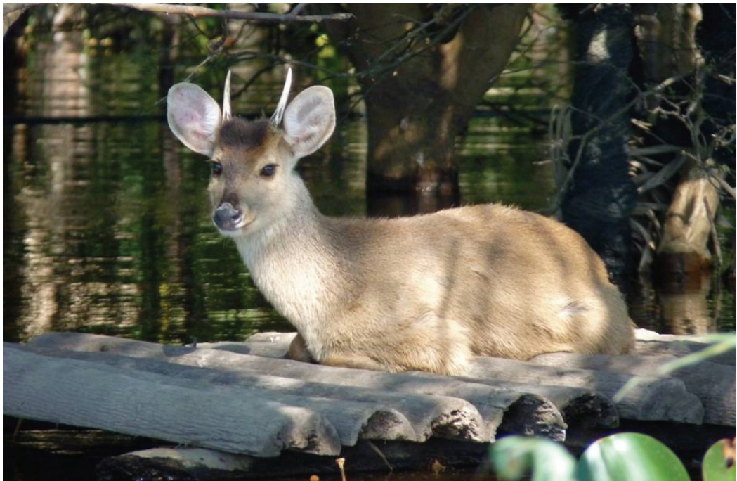
Figure 7. Brown Brocket Subulo gouazoubira , Río Negro, Alto Paraguay department.

Comments: This is the Güazu-birá of Azara (1802, 1: 57), and the name means roughly deer that you would like to repeat, in reference to its attractiveness for the table. The name Cervus gouazoupira G. Fischer, 1814, is based on le Quatrieme Cerf ou Gouazoubira of Azara (1801, 1: 86; Hershkovitz, 1951), but the original spelling was considered a lapsus (Cabrera, 1961) because it differed from the spelling used by Azara. The amended M. gouazoubira