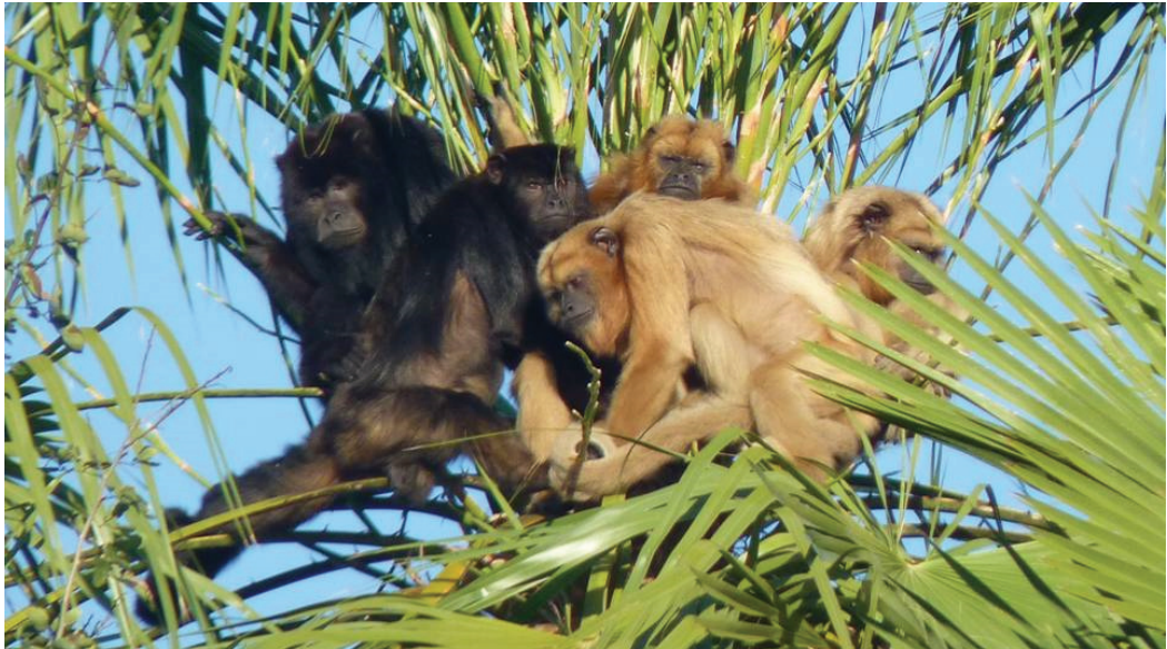
Figure 11. Black-and-gold Howler Monkey Alouatta caraya , Estación Tres Gigantes, Alto Paraguay department.

Only the hooded capuchin Sapajus cay (Illiger, 1815) occurs in Paraguay, a member of the cryptic " Cebus apella " complex. The correct scientific name for Paraguayan Sapajus has been the subject of constant debate (Elliot, 1913; Cabrera, 1917, 1939, 1957; Hill, 1960; Torres, 1983; Mantecon et al. , 1984; Brown & Rumiz, 1985; Mudry, 1990; Zunino & Mudry, 1993; Ponsà et al. , 1995; Groves, 2001; Silva Junior, 2001; Martínez et al. , 2002, 2004; Ávila, 2004; Casado et al. , 2010; Rylands et al. , 2012; Aristide et al. , 2014), and descriptions of several species and subspecies have been based on specimens from Paraguay (Rengger, 1830; Pusch, 1941).