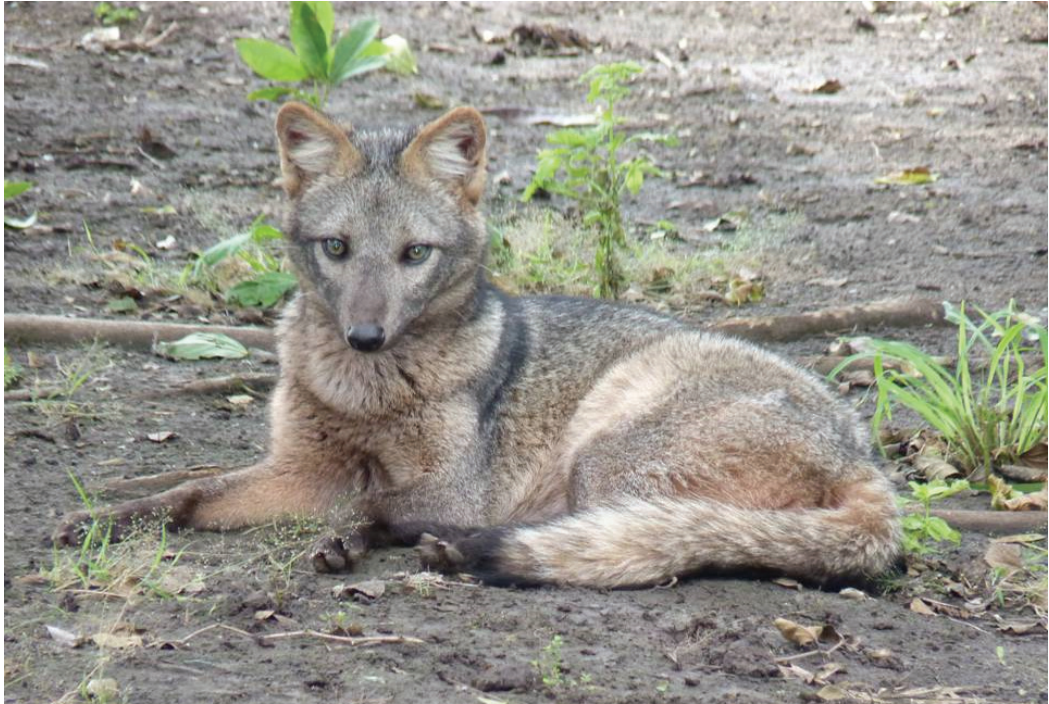
Figure 9. Crab-eating Fox Cerdocyon thous , Estación Tres Gigantes, Alto Paraguay department.

Comments: This is, in part, the Agüarachay of Azara (1802, 1: 271; see Smith & Ríos, in press) and l'Agouarachay of Azara (1801, 1: 317). Bertoni (1914a) listed only Canis brasiliensis Schinz, 1821, for Paraguay (a name based partly on Azara), with Canis thous treated as hypothetical, but he later confessed his ongoing confusion as to the nomenclature (Bertoni, 1925b).