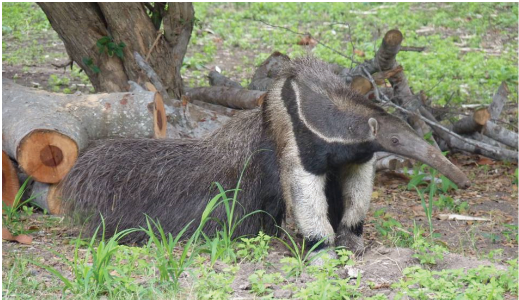
Figure 4. Giant Anteater Myrmecophaga tridactyla , Estación Tres Gigantes, Alto Paraguay department. (Photo: Paul Smith).

Comments: This is the Ñurumi or Yoquí of Azara (1802, 1: 66) and le Gnouroumi of Azara (1801, 1: 89). The Guaraní name Yurumí means “little mouth”. The scientific name M. jubata Linnaeus, 1766, was long used for the species, but is antedated by M. tridactyla Linnaeus, 1758 (Thomas, 1901f). Rehn (1900) had argued that M. jubata was valid, because M. tridactyla was based on a composite description.