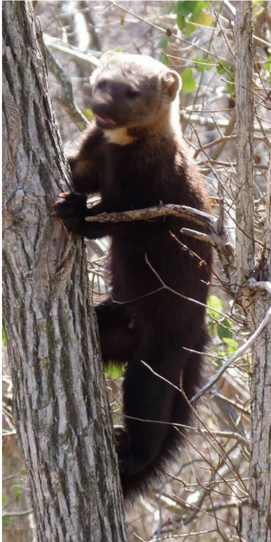
Figure 10. Tayra Eira barbara , Cerro León, Alto Paraguay department.