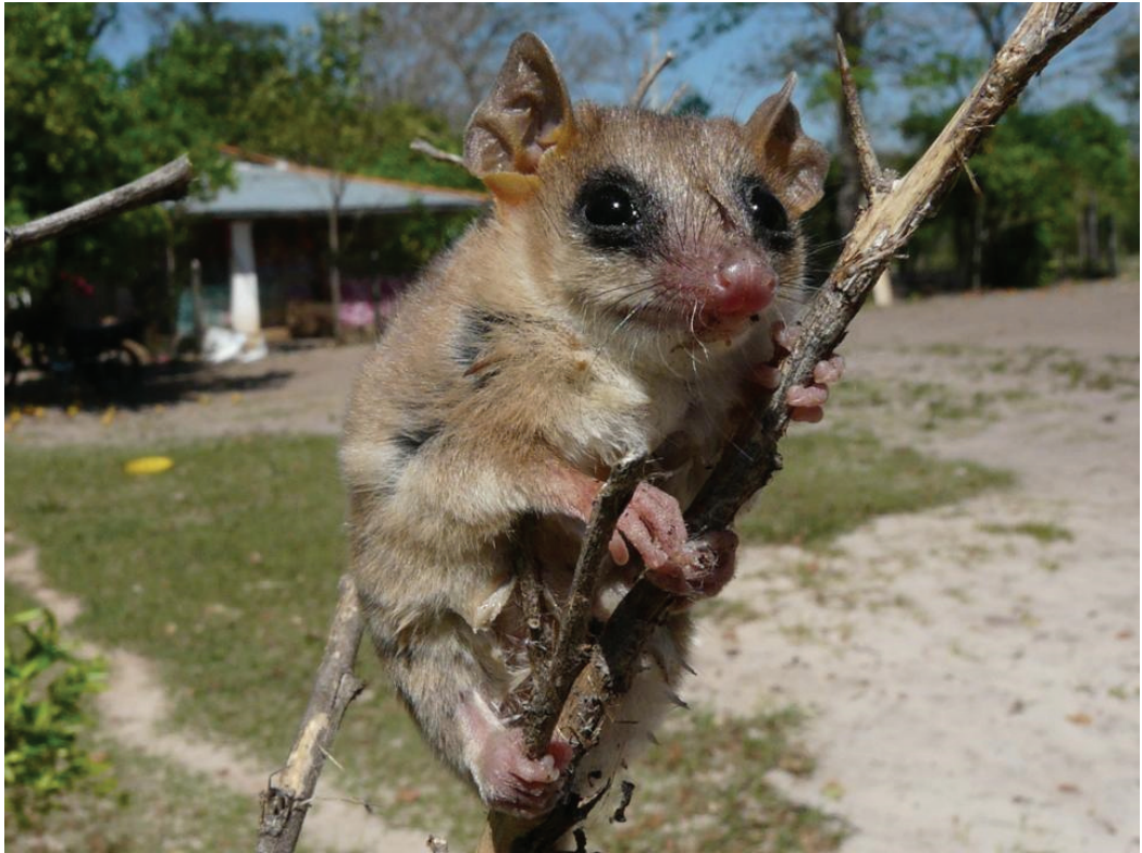
Figure 3. Chaco Mouse Opossum Cryptonanus chacoensis , Rancho Laguna Blanca, San Pedro department.

(NHM 4.1.5.48; 11 September 1903). It appears that Bertoni's concept of M. pusilla included both of these species.