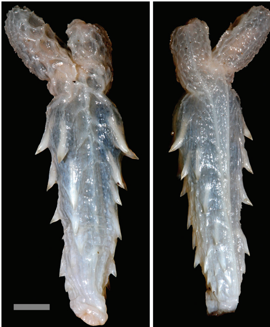
Figure 4. Hemipenis of P. shawnella showing the asulcate (left) and sulcate (right) views. Gray bar = 3 mm.

posterior black nuchal collar was absent dorsally, with the black mid-dorsal line forming a broad, smudgy spot covering an entire scale where it contacted the yellow nuchal collar, and bordered either side by a single orange scale between it and the black lateral bands. Dorsally, it was a deeper red, and ventrally it was a deeper orange-red, than the holotype. Dorsals 15-15-15, ventrals 197, subcaudals 26 (divided), temporals 0+1/0+1. Additional images of the known specimens are stored in FigShare ( https://doi.org/10.6084/m9.figshare.c.5804246.v1 ).