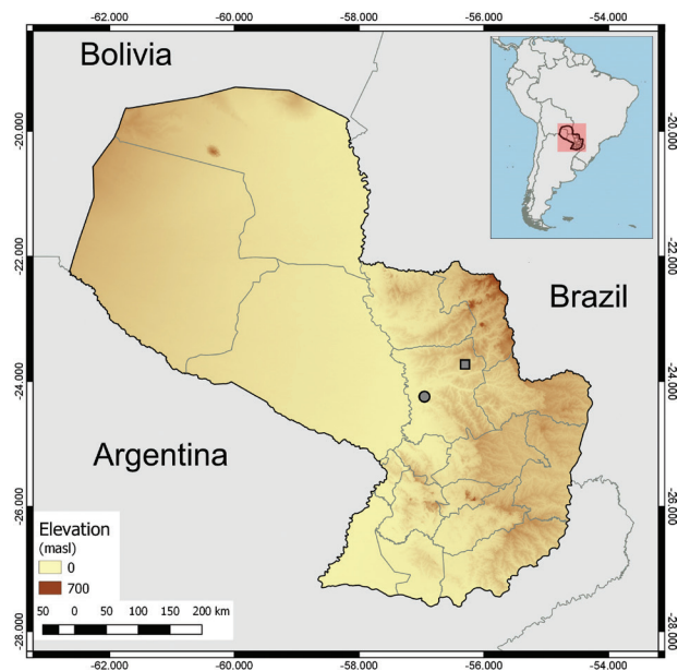
Figure 1. Known localities for Phalotris shawnella sp. nov. in San Pedro department, Paraguay Square: type locality. Circle: additional locality at Colonia Volendam.

During field work at Rancho Laguna Blanca (San Pedro department, northeastern Paraguay) (Fig. 1) two specimens of a Phalotris nasutus group snake were captured, that exhibited intermediate characters between P. nigrilatus and P. lativittatus (the latter not previously recorded in Paraguay). With the photographing of