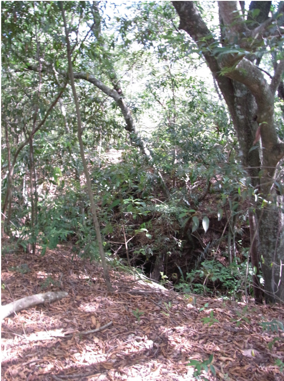
Figure 5. Collection locality of holotype, Rancho Laguna Blanca, San Pedro department, Paraguay. (Photograph by Para La Tierra).

individual had both the head and tail hidden under the leaf litter. The specimen did not show any aggressive behavior, and was released after being photographed.