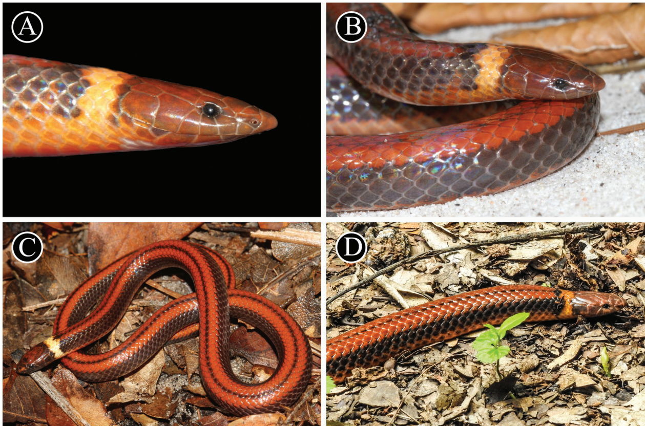
Figure 3. Coloration in life of P. shawnella sp. nov. A. Detail of the head of the holotype (CZPLT-H-594); B. Dorsolateral view of the holotype; C. Juvenile topotype specimen, kept in captivity and which later escaped; D. Live specimen photographed at Colonia Volendam.

postocular contacting the 3 rd to 5 th supralabials and only slightly smaller than the upper; single prefrontal twice as wide as long (2.3 × 4.2 mm); supraocular twice as long as wide (2.2 × 1.2 mm); frontals slightly longer than they are wide (3.6 × 2.8 mm); paired parietals twice as long as wide (6.0 × 3.1 mm). No differences in shape in right/left sides. Eye diameter 1.1 mm.