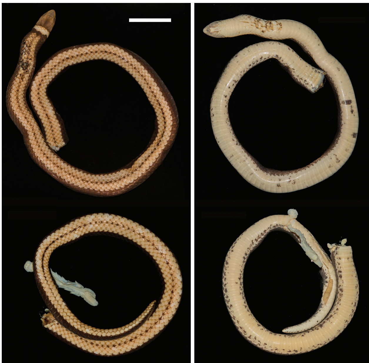
Figure 2. Dorsal (left) and ventral (right) overviews of the holotype of P. shawnella sp. nov. The specimen was accidentally severed during collection. Scale bar: 2 cm.

in P. multipunctatus ); 2) red-orange ventral scales lightly and irregularly spotted with black, mainly on the posterior half of the body (ventral scales black with broad white posterior edges forming banded pattern); 3) head brick red (in adult) or black (in juvenile) lacking any white spotting (head black with profuse white spotting); 4) infralabials uniform (each infralabial with a single large white medial spot); 5) longitudinal dark mid-dorsal stripe present (longitudinal dark mid-dorsal stripe absent).